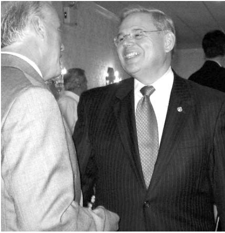
R: Senator Robert Menendez at "Meet & Greet" June 9th