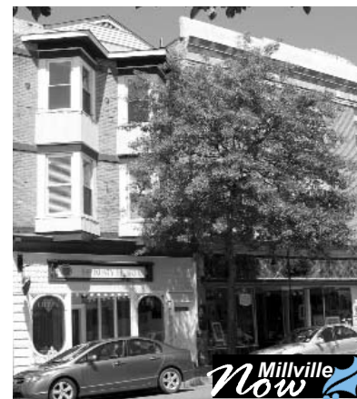
Then Photograph taken 1909 West side High Street 100 block. (Far left)