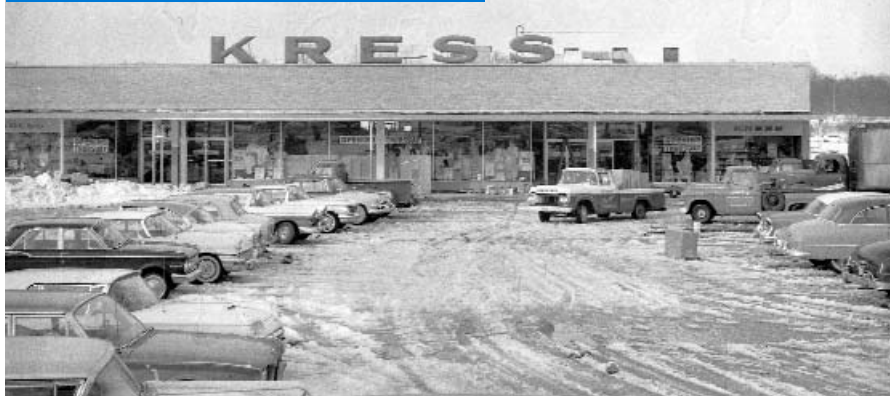
Historic photographs provided from the Steelman Photo Collection